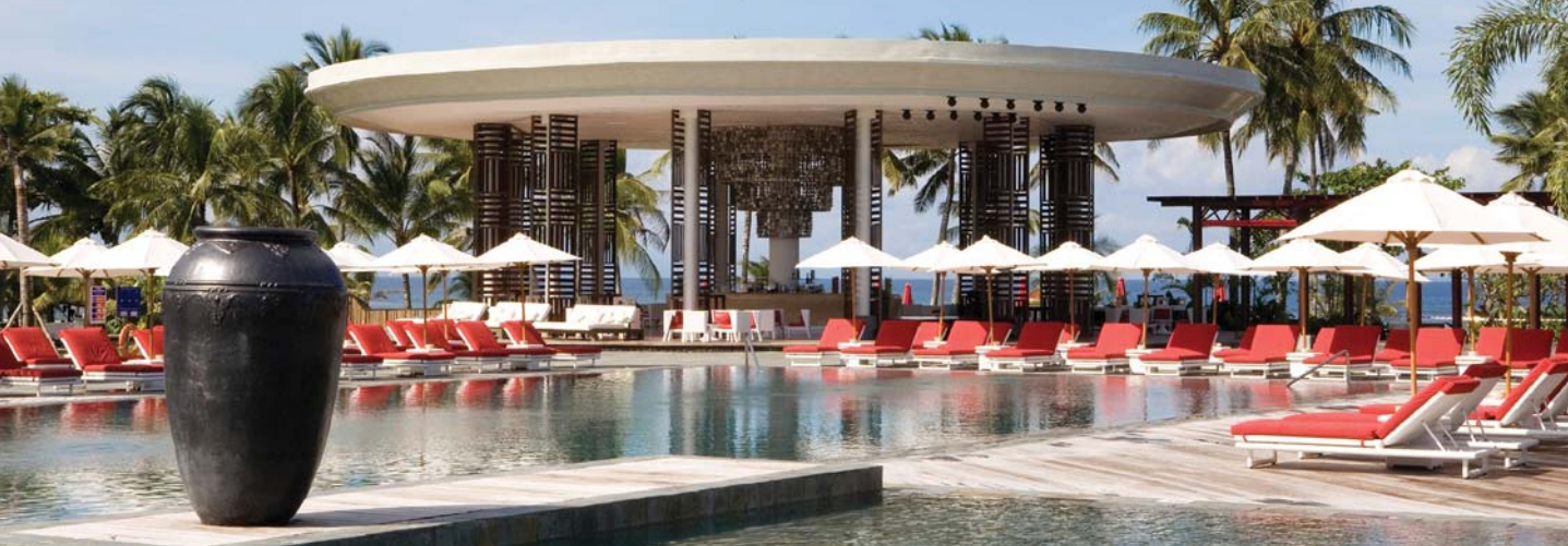
Main bar with poolside