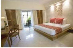
Deluxe Park View